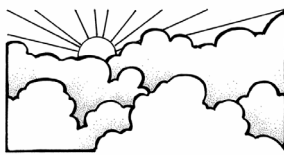
© J. S. Palach Co., Inc.