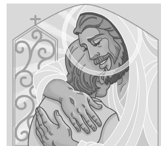
Your reward will be great in heaven © J. S. Paluch Co., Inc.

The 50/50 raffle envelope is to be put in the collection along with your sacrificial weekly treasure envelope.