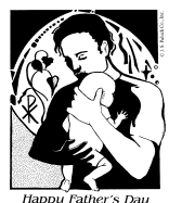
Happy Father's Day