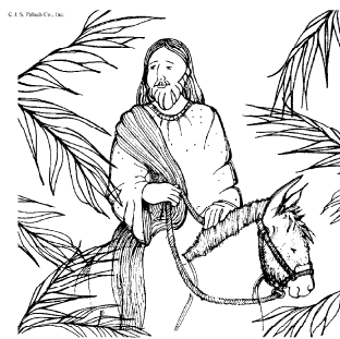
Blessed is he who comes in the name of the Lord.