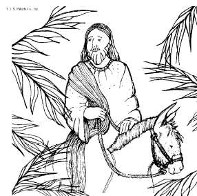
Blessed is he who comes in the name of the Lord.

The Environment & Art Committee needs your help installing the Easter decorations in our church. We are very thankful of the stewardship response in the past and hope to see more participants this year. Please say you will invest God's gifts of your time and talents by coming to the church on Saturday, March 26th starting at 9:00am. There are jobs for everyone, for the young and for our seniors too—and no experience is necessary! We will be working at least until noon, so come whenever you can.