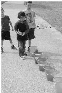
The Bucket Game