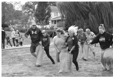
Look at the determination to win!