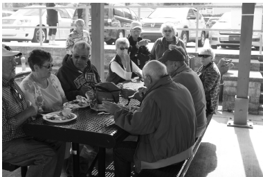
Could this be our choir?