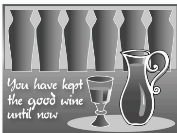
© 2009 J. S. Paluch Company, Inc.

Monday: Heb 5:1-10; Ps 110:1-4; Mk 2:18-22 Tuesday: Heb 6:10-20; Ps 111:1-2, 4-5, 9, 10c; Mk 2:23-28, or any of a number of readings for the Day of Prayer Wednesday: Heb 7:1-3, 15-17; Ps 110:1-4; Mk 3:1-6 Thursday: Heb 7:25 — 8:6; Ps 40:7-10, 17; Mk 3:7-12 Friday: Acts 22:3-16 or 9:1-22; Ps 117:1bc, 2; Mk 16:15-18 Saturday: 2 Tm 1:1-8 or Ti 1:1-5; Ps 47:2-3, 6-9 or Ps 96:1-3, 7-8a, 10; Mk 3:20-21 Sunday: Neh 8:2-4a, 5-6, 8-10; Ps 19:8-10, 15; 1 Cor 12:12-30 [12-14, 27]; Lk 1:1-4; 4:14-21